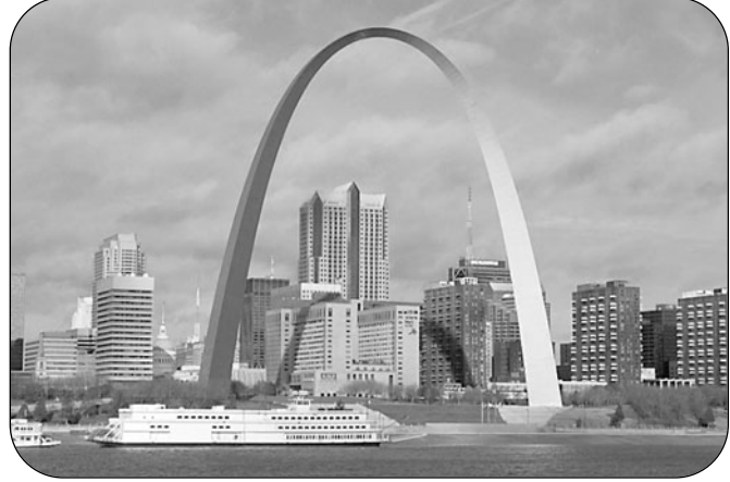
St. Louis, Missouri

You can give the following prayer to be taken at night in your soul consciousness to Archangel Chamuel's home in the heaven-world.