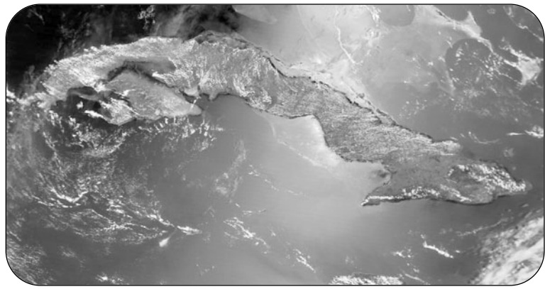
Satellite view of Cuba

You can give the following prayer to be taken at night in your soul consciousness to Archangel Zadkiel's home in the heaven-world.